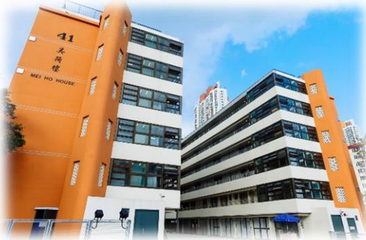
YHA Mei Ho House Youth Hostel (Sham Shui Po, Kowloon)