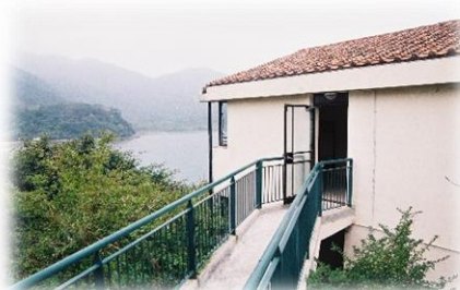
Bradbury Hall (Chek Keng, Sai Kung)