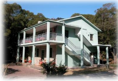
YHA Ngong Ping SG Davis Youth Hostel (Lantau Island)