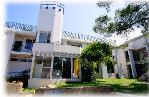
Jockey Club Mt. Davis Youth Hostel (Western, HK Island)