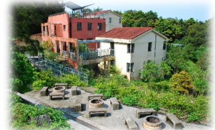
Sze Lok Yuen (Tai Mo Shan, Tsuen Wan)