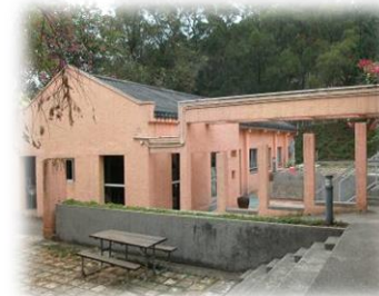
Pak Sha O Youth Hostel (Sai Kung)