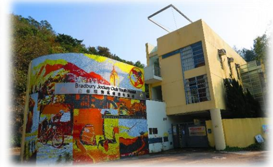
Bradbury Jockey Club Youth Hostel (Tai Mei Tuk, Tai Po)